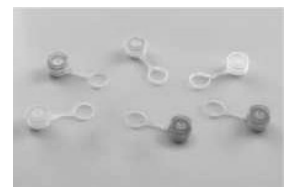
Six Cap Colors